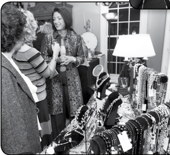
From jewelry to stationery, there was something available for everybody's holiday shopping list.